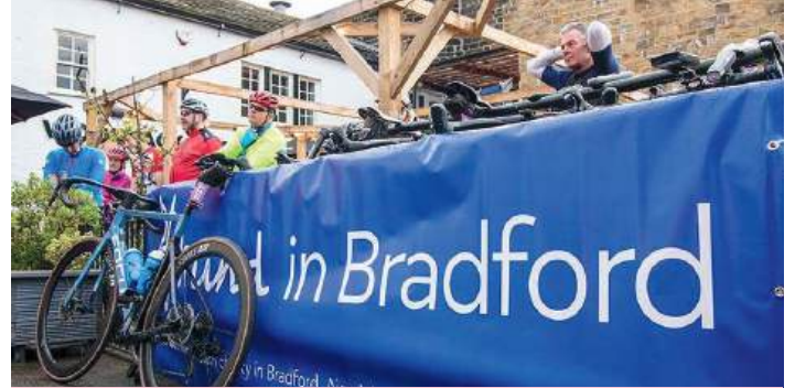
All smiles at Barton Legal's Dales 50