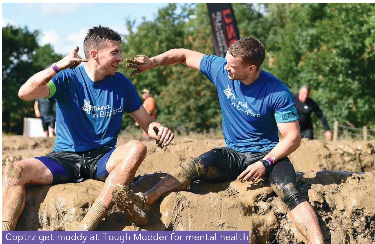
Coptrz get muddy at Tough Mudder for mental health