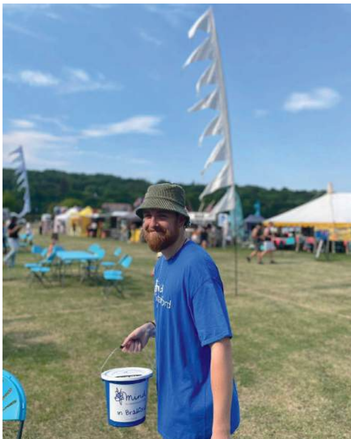
Volunteer at Ilkley Food Festival