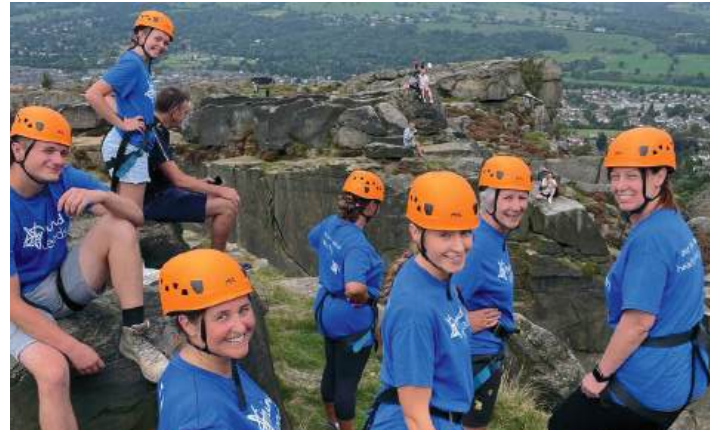
Brave supporters take on the abseil at Ilkley Cow and Calf