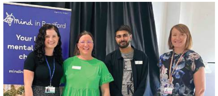
TL Dallas speak at our first Mind your Business networking event

TL Dallas are a family run business, born and bred in Bradford. Passion for their community and mental health runs all the way through their team and they have channelled this into support for Bradford District and Craven Mind for a number of years. Their team have fundraised in many of our annual events, including 600 Mile September and Step Up for Bradford. And shared their knowledge of mental health and wellbeing as an employer at our first Mind your Business event.