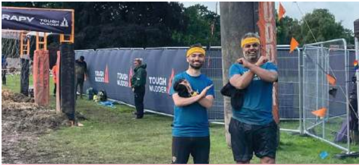
The Xpandables complete the Tough Mudder